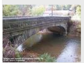
Butler Plank Road over Pine Creek

In 2006, Shaler Township and Allegheny Rivertowns Enterprise Zone (ARTEZ) requested the assistance of the Western Pennsylvania Brownfields Center at Carnegie Mellon to address the redevelopment issues in the Shaler community. As a result, the Route 8 Corridor of Opportunity Partnership was formed to develop a workshop focusing on a 1.5 mile corridor along Route 8. The Planning Committee has developed a program to address concerns expressed by both the Township and property owners in the area.